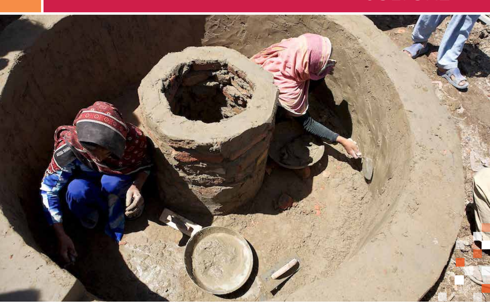
PDNA GUIDELINES VOLUME B